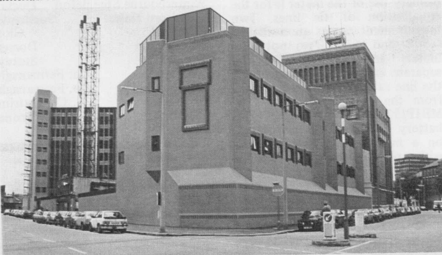
The new television complex in Belfast

The smaller studio, C, uses a single Link 125 camera for local news contributions. The floor area is some 35 sq m, and, like studio B, it has Colortran luminaires plus a twenty-way DTL lighting console. The vision mixer comprises a Cox T16 sixteen-channel desk, with sound being handled by a twelve-channel Neve desk.